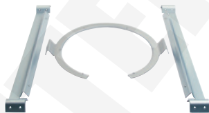
C-Ring / V-Rails

NOTE: IT IS MANDATORY THAT THIS SECONDARY SUPPORT BE UTILIZED IN DROP CEILINGS FOR SAFETY AND SEISMIC CONSIDERATIONS.